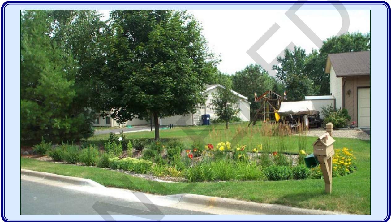
Figure B-1 Typical Bio-infiltration ‘Rain Garden’

Note curb cut inlet. Design should be based on regional plants and growing conditions.