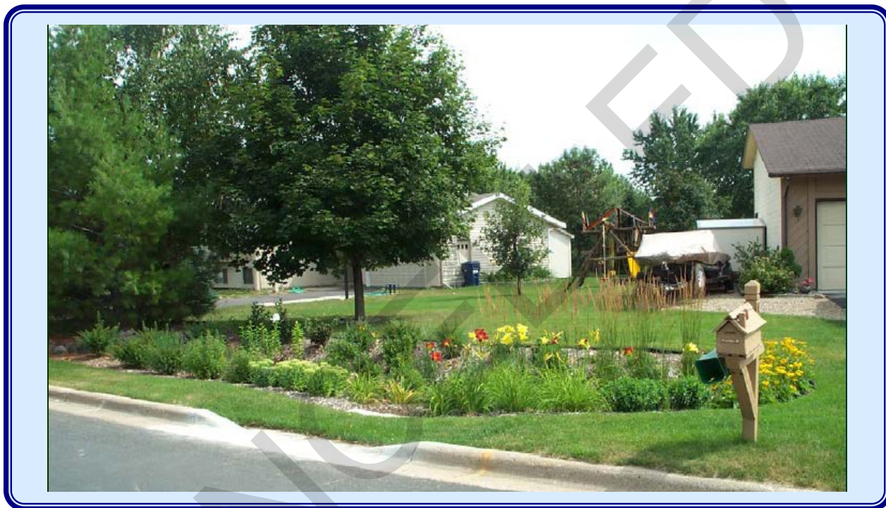
Figure B-1 Typical Bio-infiltration ‘Rain Garden’

Note curb cut inlet. Design should be based on regional plants and growing conditions.