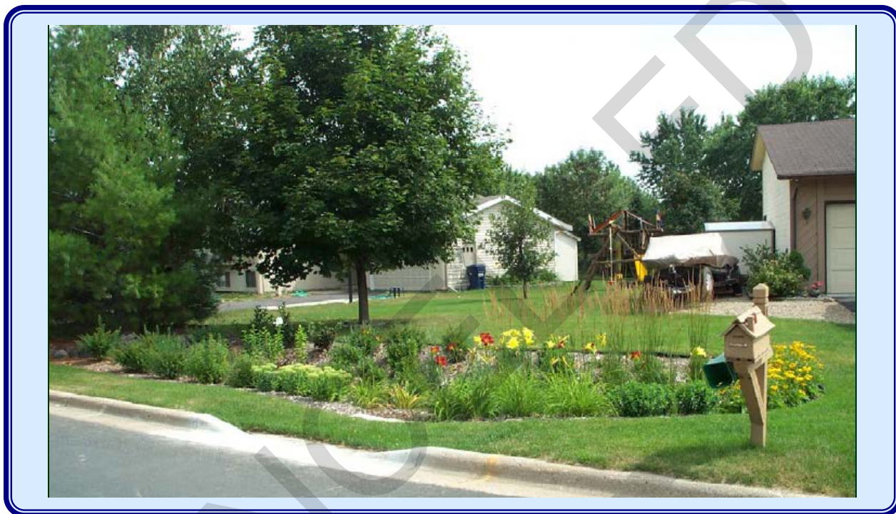
Figure B-1 Typical Bio-infiltration ‘Rain Garden’

Note curb cut inlet. Design should be based on regional plants and growing conditions.