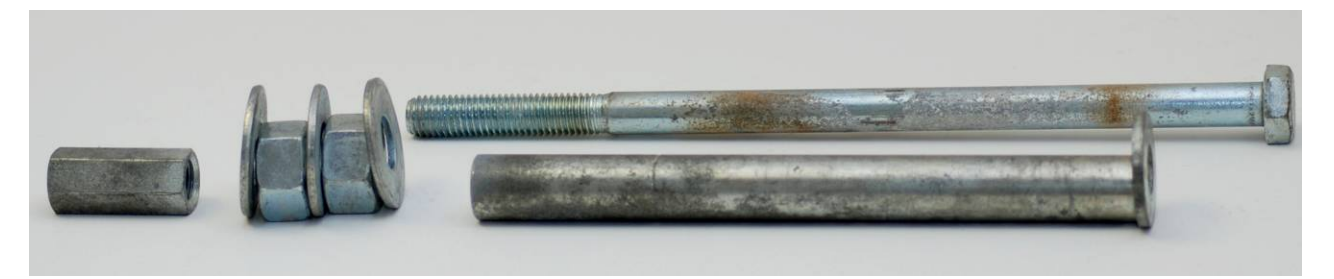
Figure 2-3 Assembled Modified Anchor