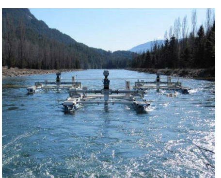
(b) Hydrokinetic free-flowing river application<sup>2</sup>