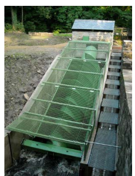
(a) Archimedes Screw<sup>1</sup>

Archimedes screw turbines – unlike hydrokinetic turbines, Archimedes screws are designed to utilize a site with some change in head. Archimedes screws, as shown in image (a) on the following page, rely on the installation of an open chute. In operation, they rotate slowly and require a gear box to step up the rotational speed of the generator.