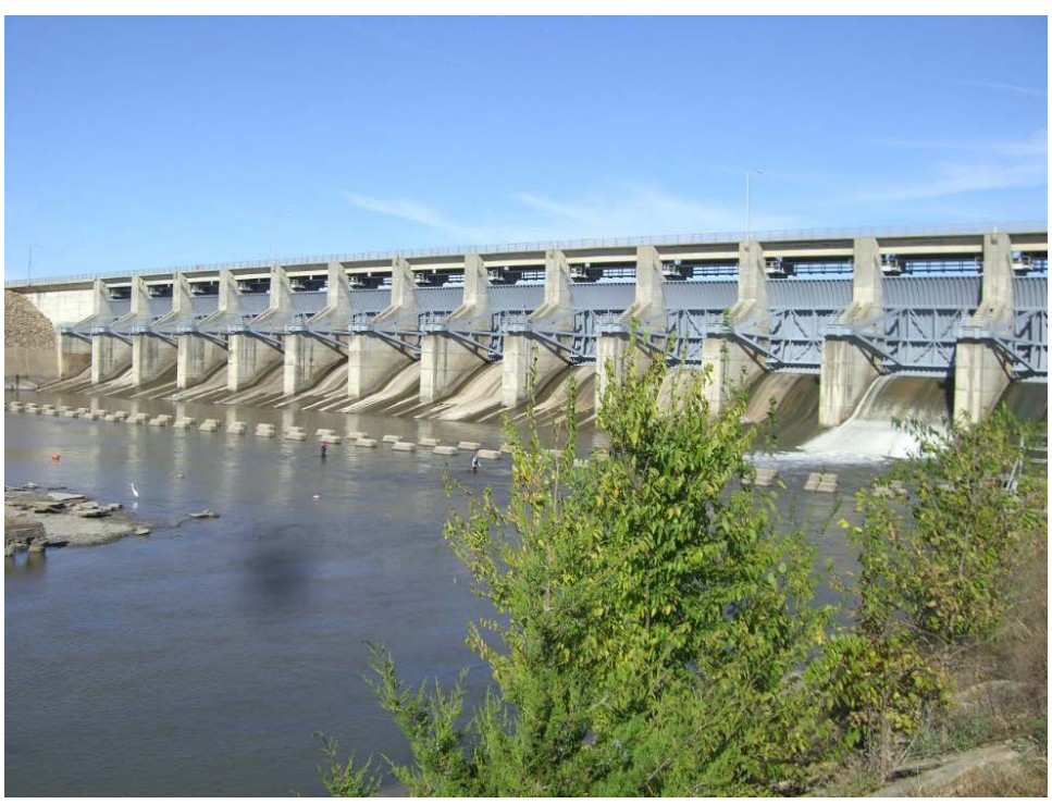
(j) John Redmond Dam