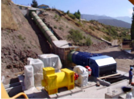
(d) Ossberger Crossflow<sup>3</sup>

(kinetic) energy. An impulse turbine then captures the kinetic energy of the stream emerging from the nozzle(s).