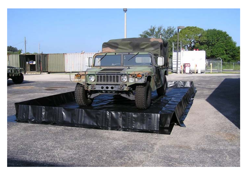
Figure A1. Containment structure called The READY BERM ™ to collect spilled or leaked petroleum, oil and lubricant (POL) products from a military wheeled vehicle.

ii. In practice, a professional engineer (PE) must certify the adequacy of the discharge prevention system (or the system the PE recommends in the SPCC Plan). Although not specifically identified as secondary containment systems in 40 CFR 112.7(c), buildings can be adequate diversionary structures if they exhibit the containment characteristics of dikes, retaining walls, or other barriers. The floors and walls of the structure would have to be sufficiently impervious to contain oil (e.g., free of floor drains, cracks, and porous joints or gaps). Note that the bulk storage secondary containment requirements described in 40 CFR 112.8(c)(2), i.e., impervious secondary containment for the largest single container plus sufficient freeboard to contain precipitation, need not be provided.