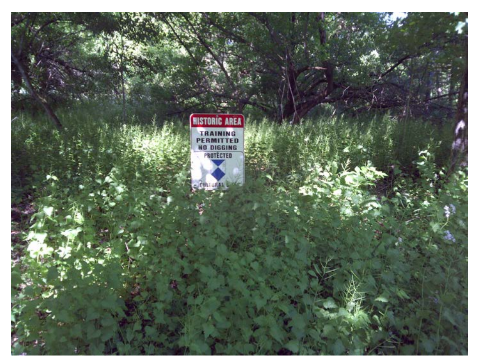
Figure B-5. Site of a former village at Fort Drum hardened for training use. Signs delineate the area as a site of cultural importance, (ERDC-CERL, 2013).