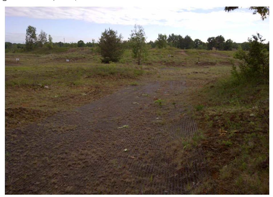
Figure B-1. Plastic geogrid netting is providing soil stabilization in an archaeologically sensitive training area at Fort Drum (ERDC-CERL, 2013).

Geogrids are also effective in reinforcing slopes and walls, and as a base-layer construction material. In archeological aspects, the grids are used to reinforce and stabilize soils, especially if the area will later be used for military training (Figure B-1) (Wagner 2007, 26).