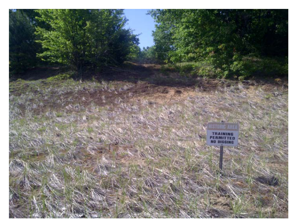
Figure B-4. An example of a historic site that has been stabilized and is now available for certain types of training (ERDC-CERL, 2013).