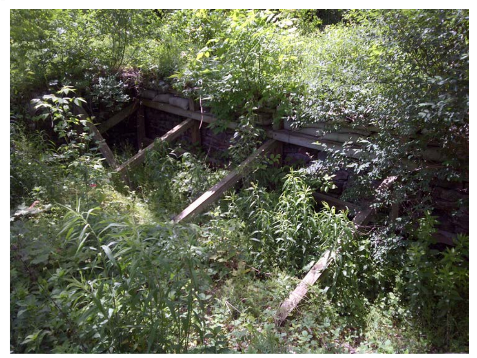
Figure B-2. A stone foundation has been stabilized for use during training at Fort Drum (ERDC-CERL, 2013).

Some above-ground historical structural sites can be hardened by building structures around the historical one. This reinforcing structure around the historical structure helps keep it upright and intact (Figure B-2) (Wagner 2007, 47). After a site has been hardened, signage should be placed at the site to inform soldiers on the historical importance of the area as well as what types of activities can occur on the hardened site. When site hardening is used in training, it helps heighten soldier awareness of cultural resources that are discretely located in a landscape (Quates 2013, 52).