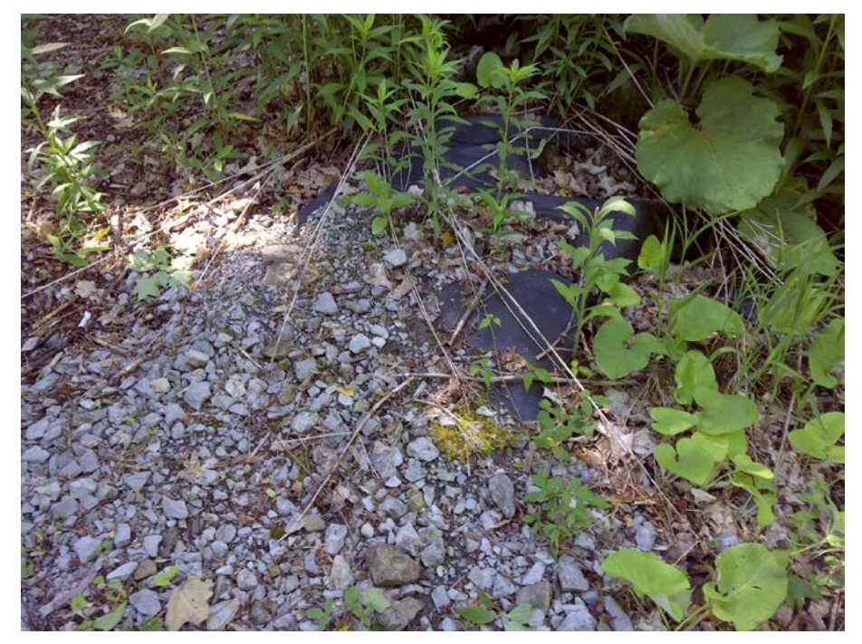
Figure B-3. Geotexttile and gravel system used to cover a hardened historic village site at Fort Drum (ERDC-CERL, 2013).

training lands manager, the CRM developed a site-hardening plan that would protect the remaining foundations in the village and that also would stabilize the surrounding landscape to make the area available for training operations (Figure B-3) (Wagner 2007, 10).