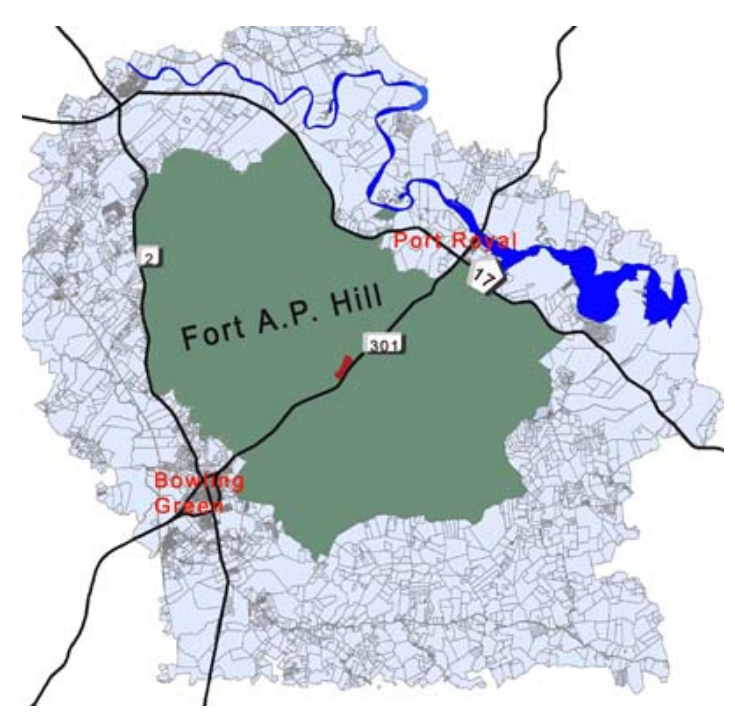
Figure B-6. Fort A.P. Hill reservation is surrounded by civilian development (http://www.aphill.army.mil/newcomerswelcome.asp).

Buffer areas around installations were not needed until recent development grew to be adjacent to military facilities. The areas around Fort A.P. Hill previously were rural and undeveloped, but recently these areas have experienced growth and development (Figure B-6). Because encroaching development potentially limits the installation's use of training lands, the Army's solution is to create zones of open space that preserve and set aside areas for natural resources while reducing neighboring developments and the associated annoyance issues between military operations and the civilian population (U.S. Army Environmental Command n.d.).