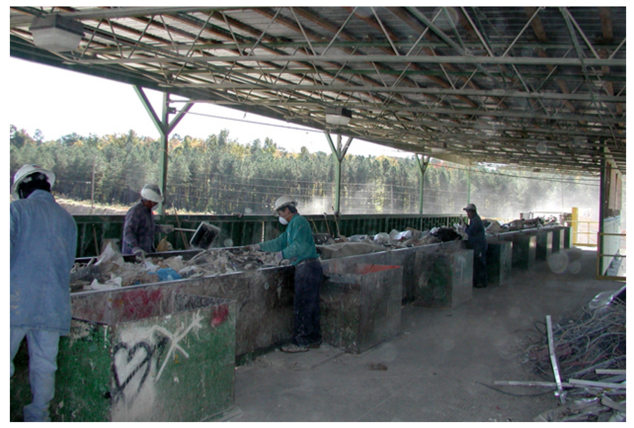
Figure C-4. C&D recycling pick line.

• Segregate waste materials on site. The RCI partner, or their contractor, may contract with individual recycling firms who deal in specific materials and a general waste hauler. The construction process lends itself to on-site segregation. When the recyclable materials are segregated, the recycling firms will generally offer a higher price for the material (if the contractor hauls it), or a lower hauling rate if the recycler performs this task. Alternatively, the contractor can subcontract with a waste hauler who provides separate receptacles for recyclable materials and debris but hauls all materials as a single service. Hauling costs for segregated materials are frequently much less than for commingled debris.