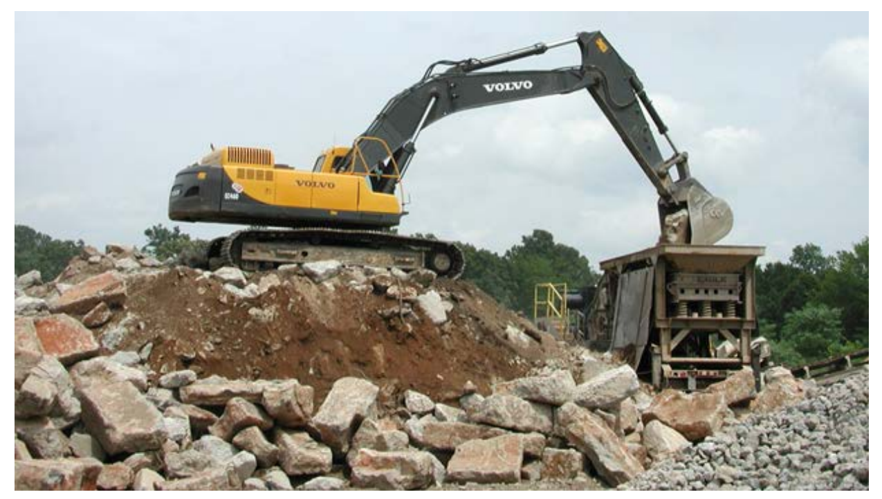
Figure C-1. Concrete recycling with on-site crusher.