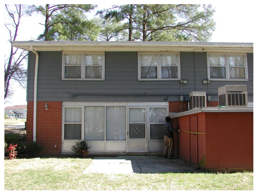
Figure B-3. Exterior rear façade of an eight-unit family housing building.