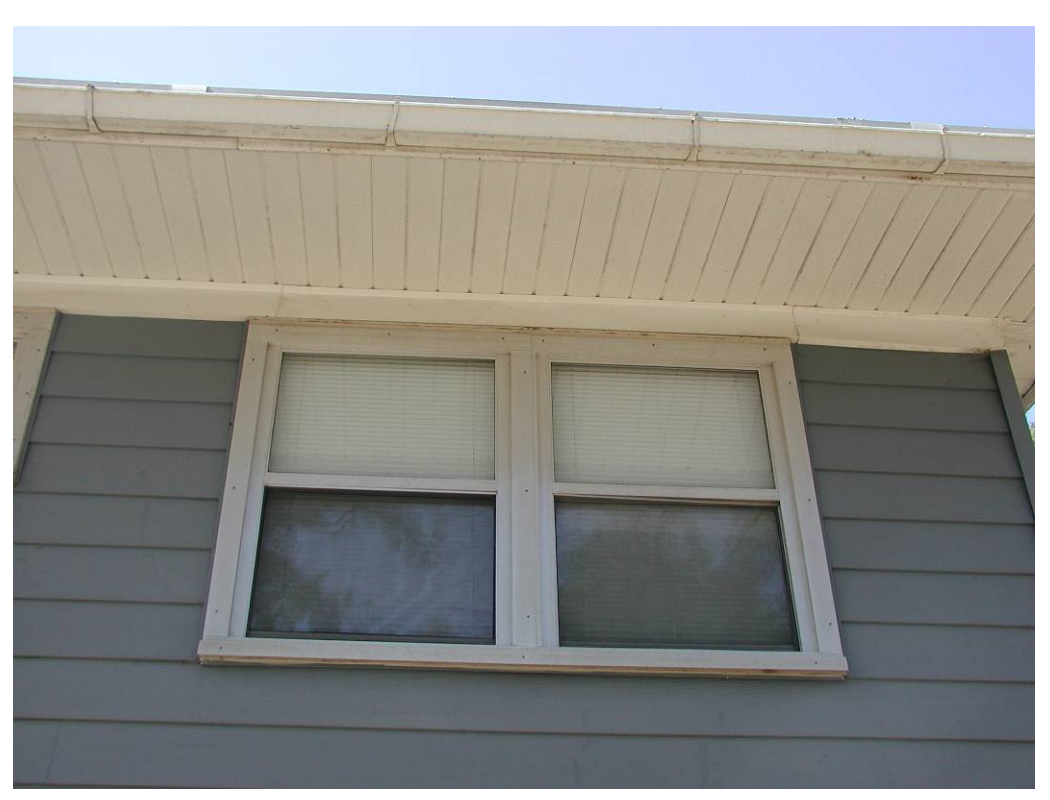
Figure B-4. Typical aluminum window of an eight-unit family housing building.