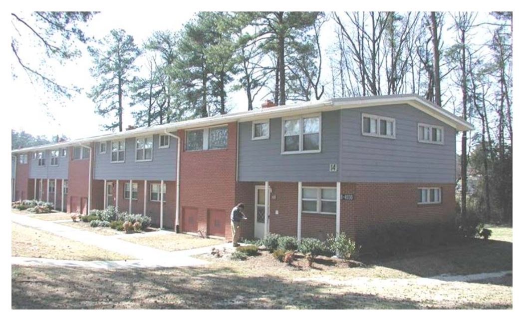
Figure B-1. Exterior façade of an eight-unit family housing building.

is typically 35-44 ft wide in nominal dimension, averaging about 30 ft in depth, and ranging from 1,050-1,320 sq ft. Most buildings consist of a single housing unit or two units per building with mirrored plans. Examples of typical Army woodframed housing are shown in Figure B-1 through Figure B-6.