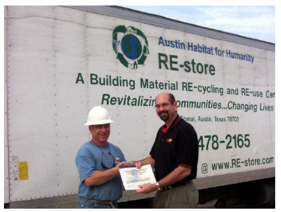
Figure A-2. Partnering with Habitat for Humanity at Fort Hood.