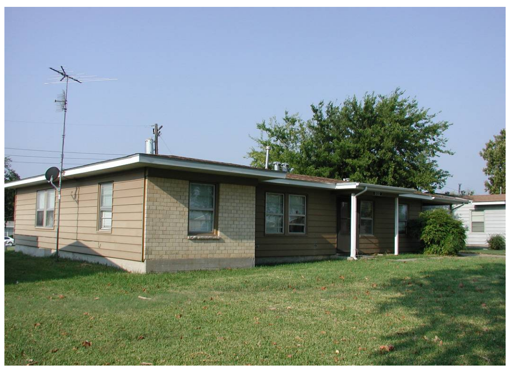
Figure B-5. One-story slab-on-grade housing unit.