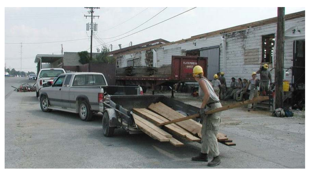
Figure C-3. A worker loads salvaged lumber for recycling.