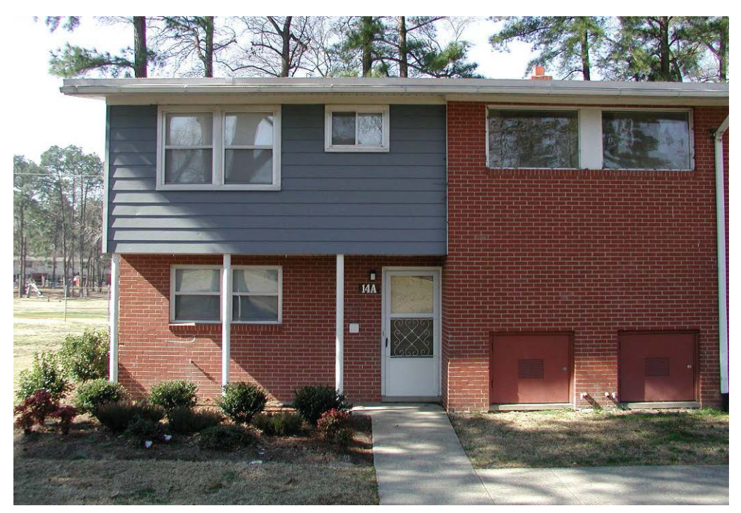
Figure B-2. Exterior entry façade of an eight-unit family housing building.