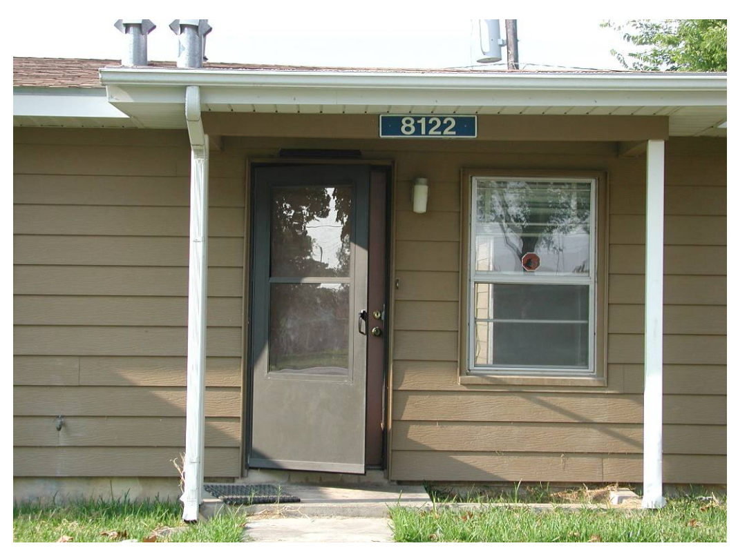
Figure B-6. Front door of one-story slab-on-grade housing unit.