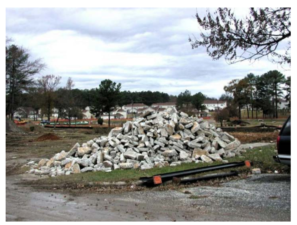
Figure A-1. Concrete recycling at Fort Bragg.