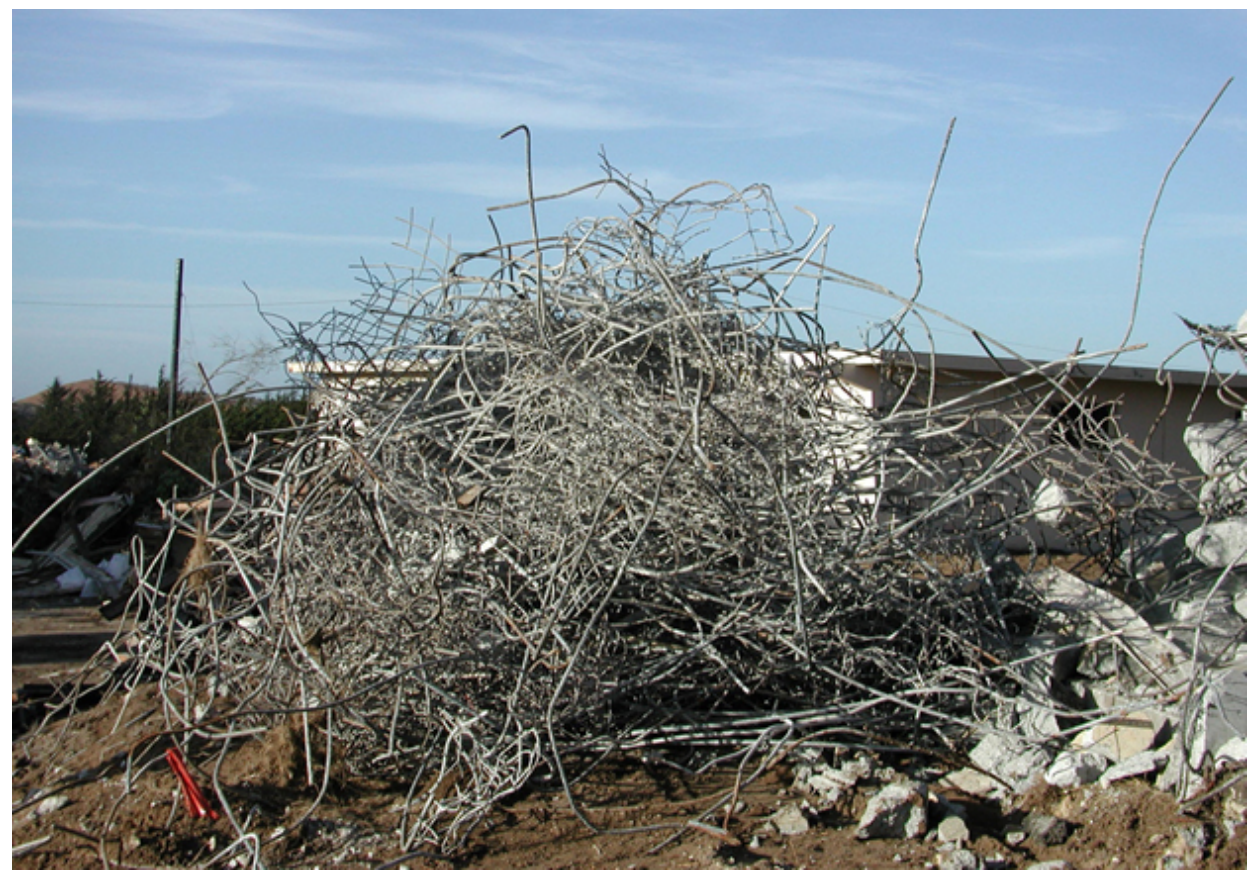
Figure C-2. Scrap metal rebar separated for recycling.