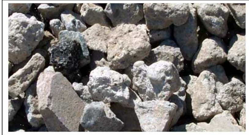
Figure 8. Crushed concrete aggregate.

The lightweight, porous cement mortar attached to RCAs causes crushed concrete aggregates to have a lower specific gravity and higher water absorption than comparable-sized natural aggregates.