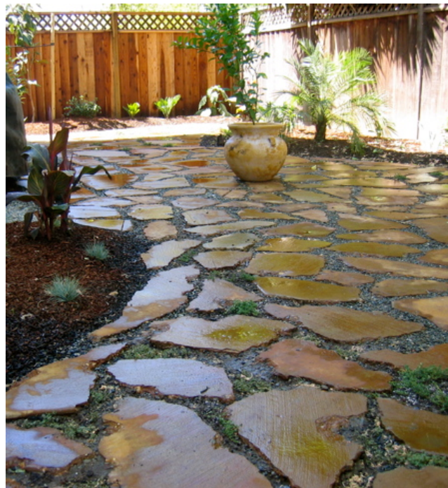
Figure 16. Stained urbanite garden.