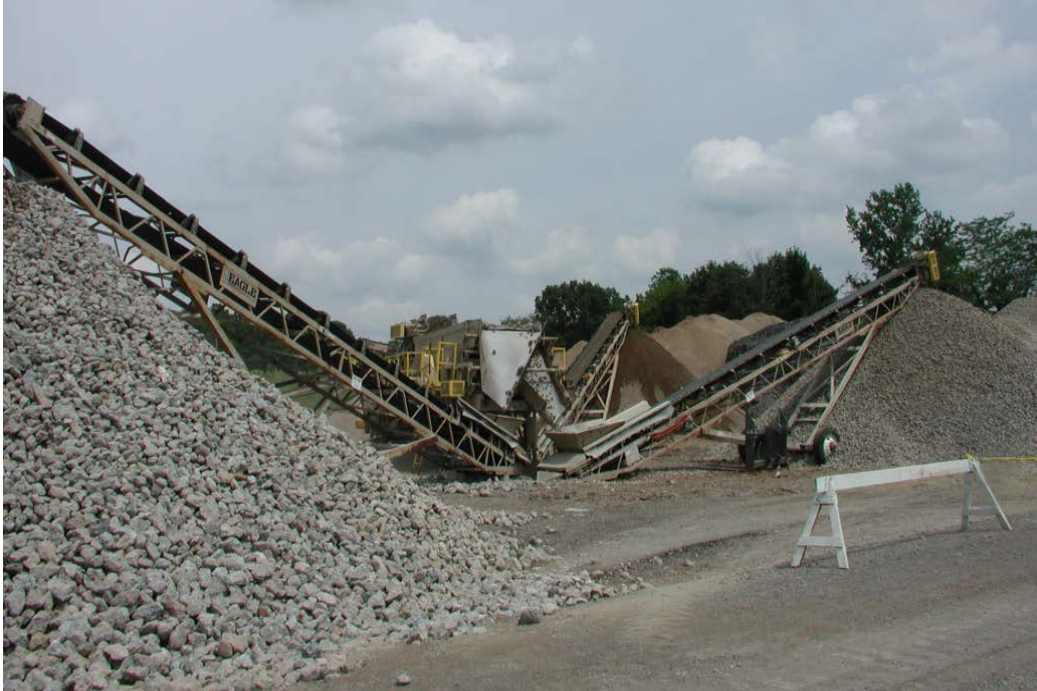
Figure 7. Concrete stockpiled by size after crushing at Fort Campbell.