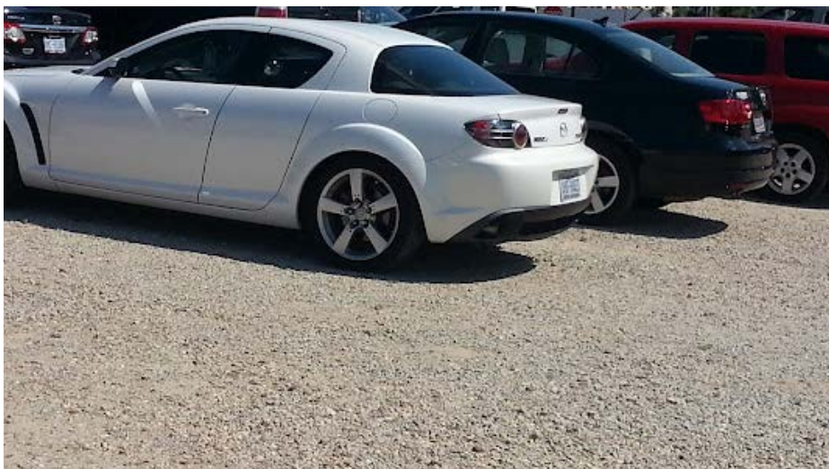
Figure 13. Parking lot made of crushed concrete at Fort Bragg.

Using crushed concrete in unpaved parking lots is also an alternative to virgin gravel (Figure 13). There is considerable opportunity to utilize this application at several installations around the country. Caution should be taken to completely remove steel from the concrete during crushing, because any remaining loose pieces of steel rebar can damage tires.