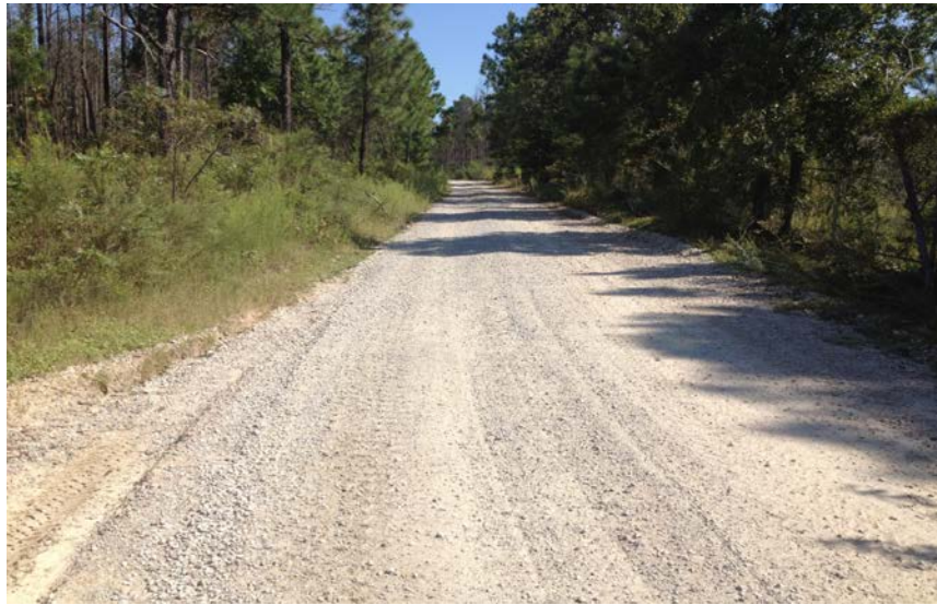
Figure 12. A fire road paved with crushed concrete at Fort Jackson.