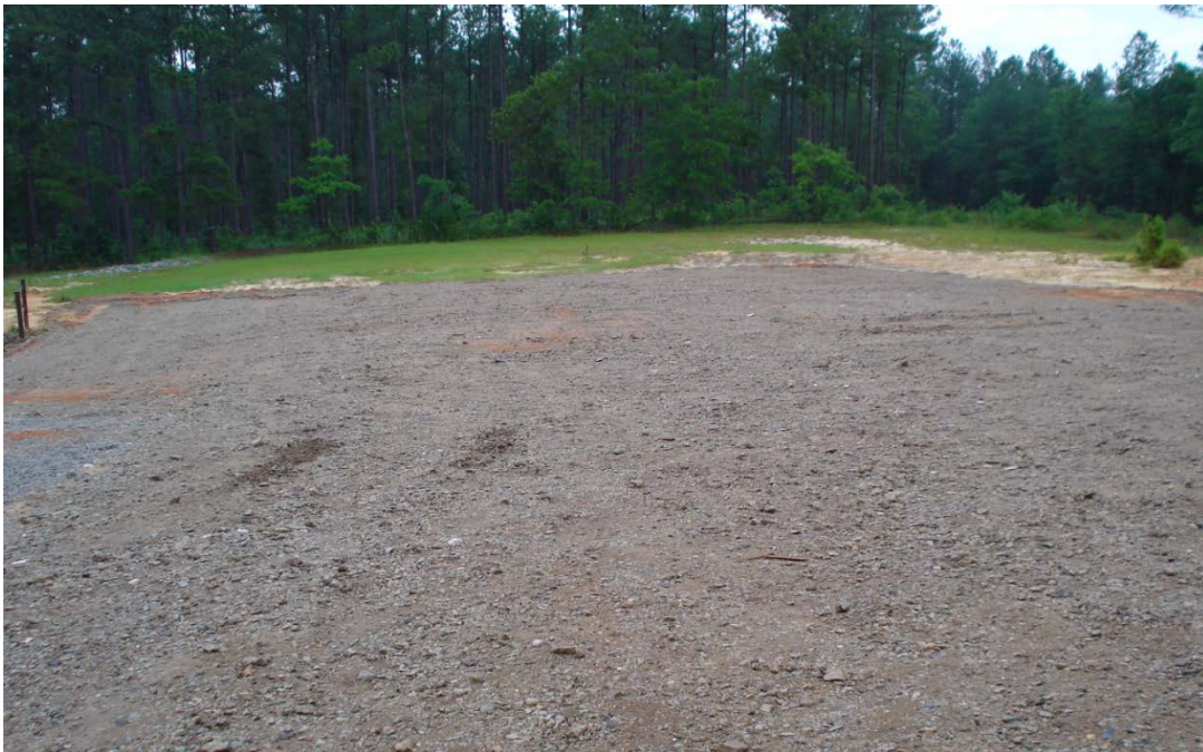
Figure 9. Concrete containing lead-based paint being used as base for a parking lot in Fort Jackson.

One big concern within potential users of crushed concrete is whether the crushed product is safe if it has been previously painted with lead-based paint (LBP). This safety concern was examined when CERL performed tests in 2010 to determine whether the lead content of crushed concrete could cause an environmental hazard that would require the paint's removal before recycling or reuse. The CERL studies concluded that due to the buffering capacity of concrete, the environmental risk is negligible from any lead contained in crushed concrete (Figure 9). However, the study also recommends that, for any given demolition project, some sampling be performed to ensure that any unusually high ratio of LBP to concrete is appropriately addressed (Cosper 2010).