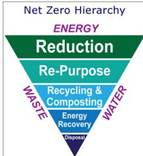
Figure 1. The Army's Net Zero installation strategy hierarchy.

Pilot installations for a single net zero goal should achieve their goal by FY 2020. The pilot installations shown in Table 1 were selected after an evaluation process from submitted applications.