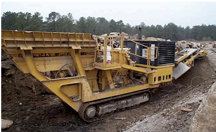
Figure 3. Mobile concrete crusher at Fort Bragg.