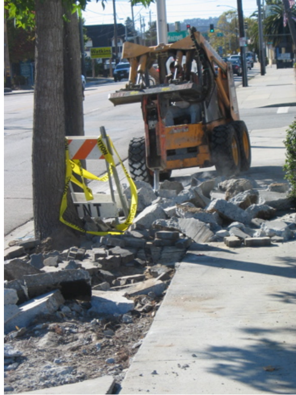
Figure 15. Potential source of urbanite.