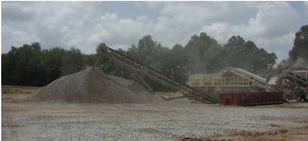
Figure 4. Concrete crushing at Fort Campbell.

The concrete crushing process consists of several steps that vary with the type of crusher used, but usually consists of removing, stockpiling, and grading the concrete product (Gabr et al 2011). After demolition, when concrete is reduced to manageable-sized pieces, it is manually inspected for large pieces of debris. The concrete is stockpiled either on site (Figure 4) or transported to the crushing facility. Concrete crushing operations are recommended to be done at warmer temperatures because the equipment could have mechanical issues if temperatures are below freezing.