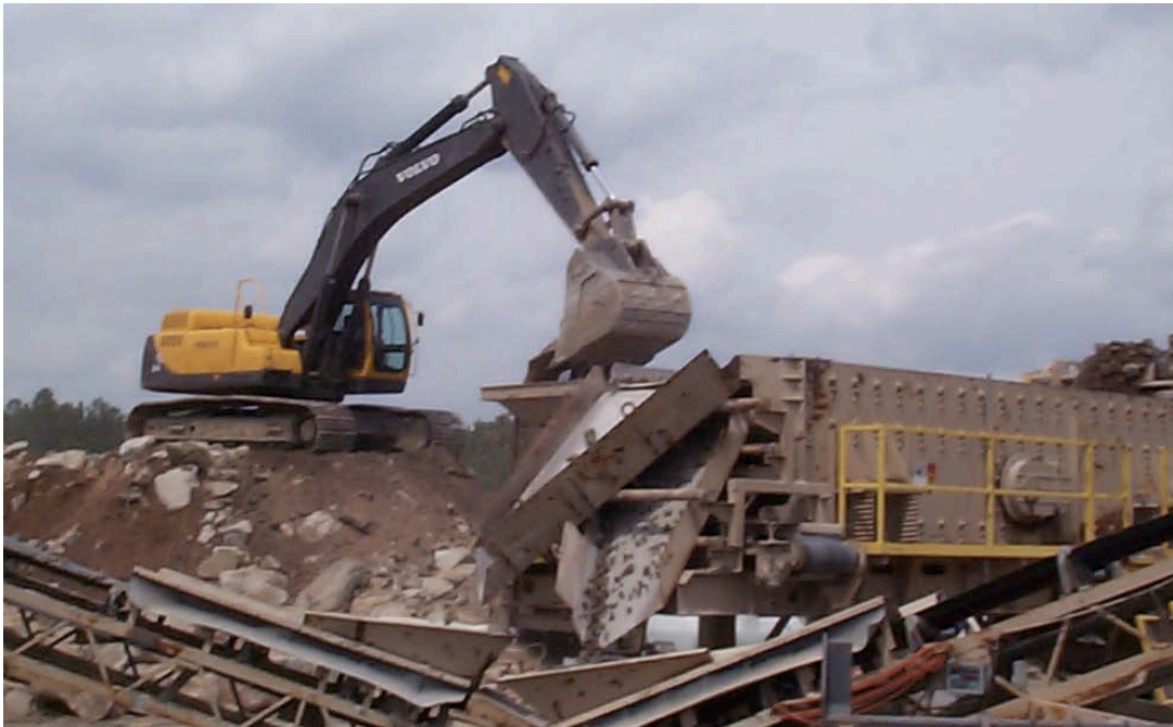
Figure 2. Portable crushing plant at Fort Campbell.