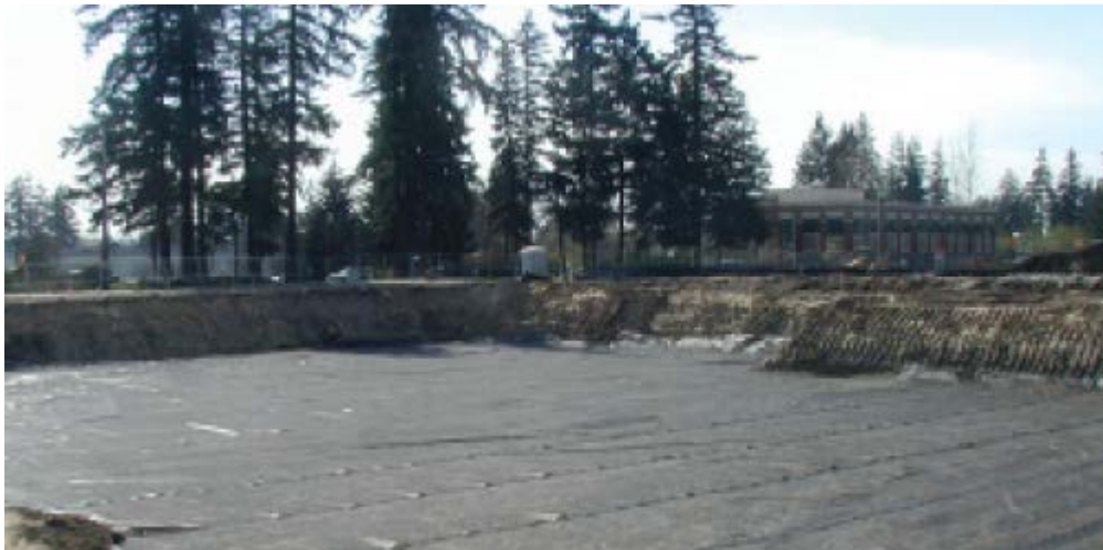
Figure 14. Soil cement and crushed concrete bed prepare an old landfill for redevelopment in Oregon.

In general, soil stabilization is a process whereby soil properties are changed to improve engineering properties such as strength. Soil stabilization can be achieved by using different techniques like compaction, dewatering, and the addition of amendment materials. Soil amendments are considered when compaction and other techniques are not feasible due to materials such as rubble being present in the soil. This problem is usually presented in brownfield redevelopment sites. 1 Crushed concrete is a material that could be added as a soil amendment. Crushed concrete has been used as fill and base material in conjunction with cement reinforcement because it strengthens the soil and minimizes the footing dimensions and the stress influence that structures would have on the soil (Figure 14).