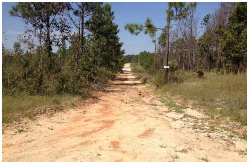
Figure 11. An unpaved fire road at Fort Jackson.

One of the most common uses for crushed concrete on installations is as a replacement for gravel on the common trails and fire breaks between training areas ( Error! Reference source not found. ). (Here, fire breaks refer to unpaved roads that cut through forest lands to slow the spread of fire and facilitate emergency access in case of a fire.) To ease access by vehicles on such unpaved areas, installations historically have often opted to use gravel. However, by using crushed concrete instead (Figure 12), installations can save a significant amount of money.