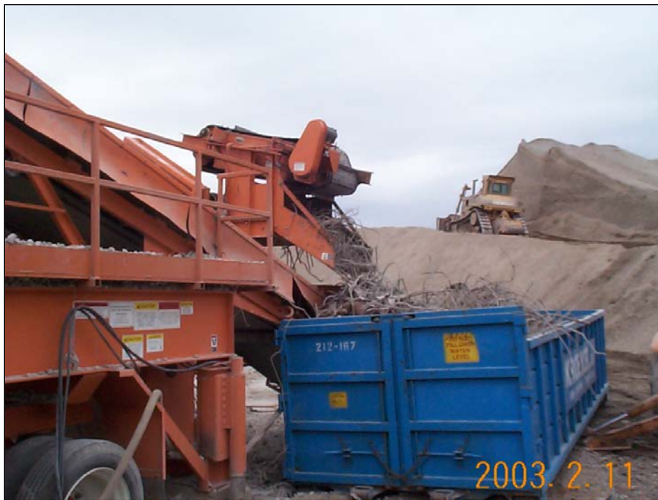
Figure 5. Removing reinforcing steel with a magnetic belt.

Recycling of reinforcement steel has increased throughout the years. The Steel Recycling Institute (2012) estimates that over 70% of reinforcing bars were recycled in 2010, compared to 47% in 2000. More than 7 million tons are recycled every year.