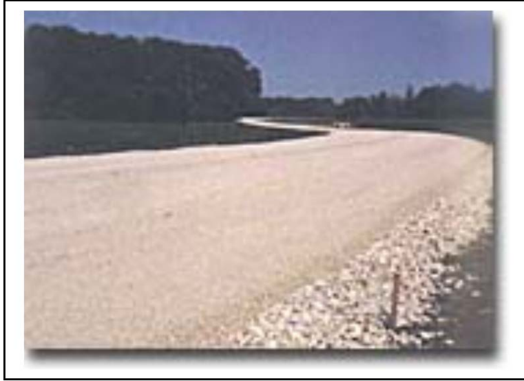
Figure 10. RCA used for granular base.