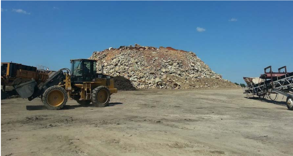
Figure 6. Concrete stockpiled before crushing at Fort Bragg.

crushed (Figure 6). Care should be taken to avoid contamination of the stockpiles, either by external sources or by the soil underneath. The crushed concrete's condition and quality will depend greatly on maintenance of the stockpile.