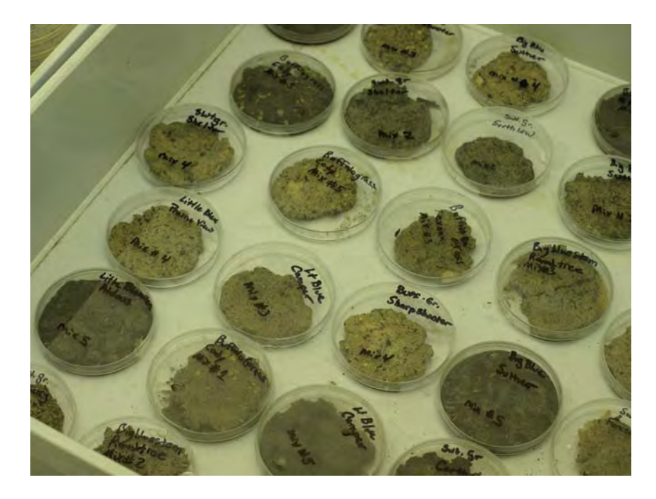
Figure B-1. Formed seed bombs labeled in petri dishes.

Grass species Switchgrass ( Panicum virgatum ), Big Bluestem ( Andropogon gerardii ), Buffalograss ( Bouteloua dactyloides ), and Little Bluestem ( Schizachyrium scoparium ) were chosen for their common use, availability, wide distribution, and inclusion in seed mixes used on many military lands. Varietals were selected and grouped based on percentage pure live seed, percentage germination, and percentage dormancy (Table B-2). Viability controls were run in the growth chamber for each varietal during this evaluation (Figure B-1). Controls were prepared in petri dishes with germination paper and 100-seed counts, then placed in the growth chamber at the same time as the seed bombs.